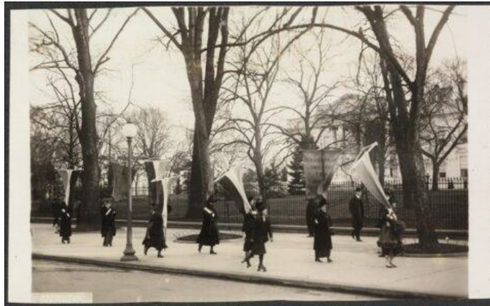
Suffrage picketers marching along Pennsylvania Avenue on March 4, 1917.

The national struggle for women's suffrage mobilized on March 3, 1913, the day before Woodrow Wilson's inauguration in Washington, D.C. The National American Woman Suffrage Association (NAWSA), in collaboration with activists Alice Paul and Lucy Burns, organized a suffrage parade down Pennsylvania Avenue. Over 5,000 women marched for suffrage but their peaceful procession was disrupted by a "surging mass of humanity that completely defied the Washington police." Read more HERE.