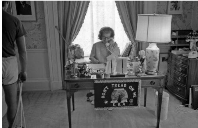
Betty Ford lobbying for the Equal Rights Amendment from her personal desk in the White House

Immediately after moving in, Betty Ford situated herself as a unique White House occupant. Betty was outspoken and unafraid to be herself, declaring "Okay, I'll move to the White House, do the best I can, and if they don't like it, they can kick me out, but they can't make me somebody I'm not." Even more unusual than her self-proclaimed independence, Betty Ford often disagreed with her husband's political positions, despite being a Republican herself. Read more HERE.