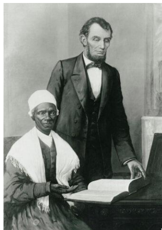
Sojourner Truth and Abraham Lincoln