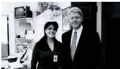
Monica Lewinsky and Bill Clinton

From Thomas Jefferson to John F. Kennedy to Bill Clinton, the list of womanizing presidents is lengthy. Throughout most of our country's history, presidential transgressions were known about by some but not talked about by many and they were well hidden from the majority of the public. Grover Cleveland fathered a child out of wedlock before his first term as president in the 1880s. FDR had a longstanding relationship with his wife's social secretary. Warren Harding, Dwight D. Eisenhower, Lyndon B. Johnson and George H.W. Bush all had affairs, either confirmed or rumored. It's been widely reported that while Jaqueline Kennedy was giving a French reporter a tour of the presidential home, she passed by one of the secretaries' desks and said in French: "This is the girl who supposedly is sleeping with my husband."